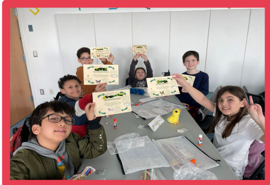
PS 2 – CASA- Queens County Farm After-school program

We would like to highlight the following schools