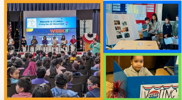
Schools participated in Civics for All Week! "Democracy Needs You!"