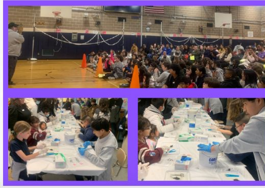
I.S. 227 – Science Night